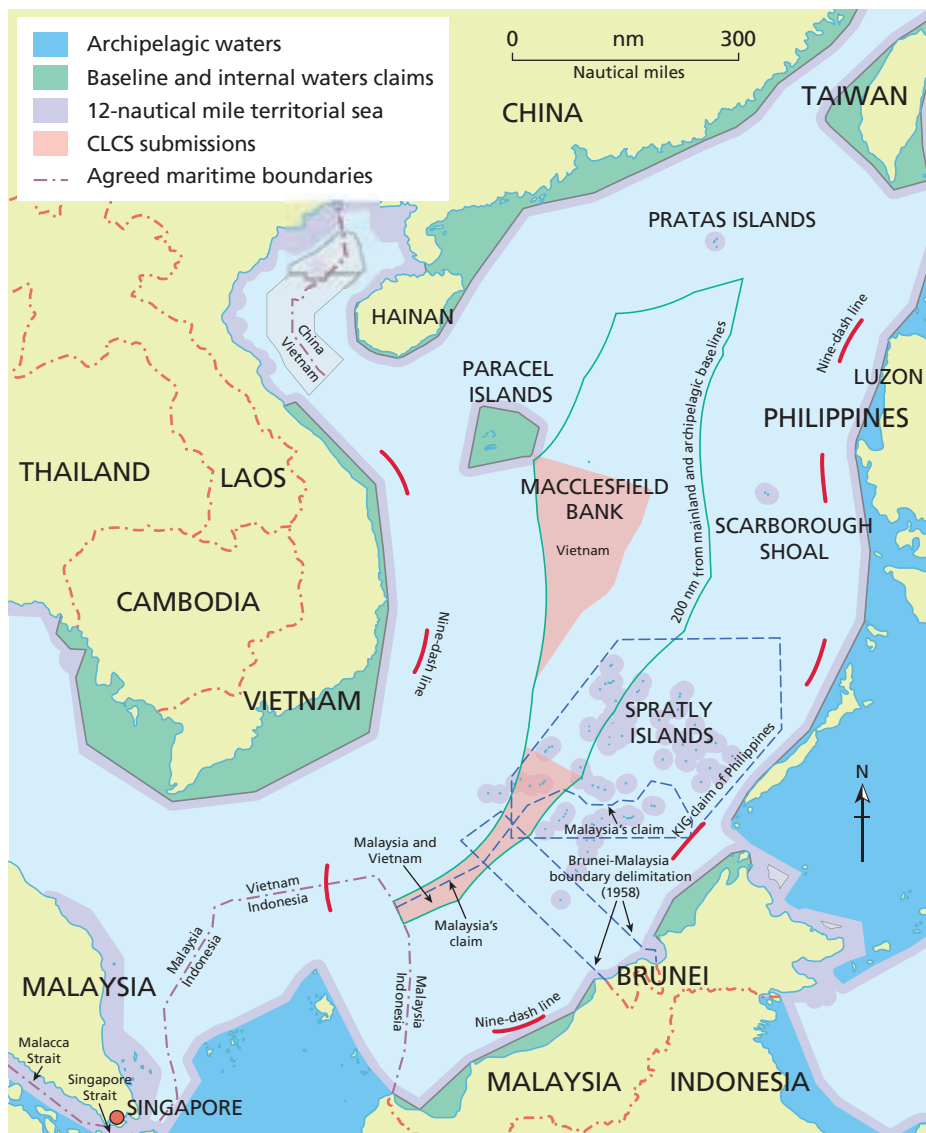
Figure 1 Competing maritime claims in the South China Sea

oil and 500 trillion ft 3 of natural gas. We cannot be sure about the potential oil and gas resources underlying disputed waters, as the competing claims make exploration all but impossible.