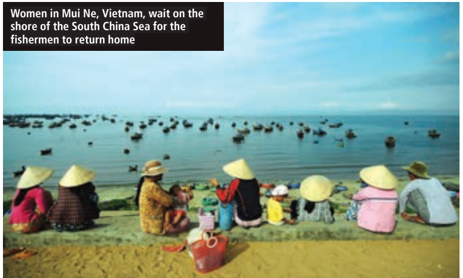
Women in Mui Ne, Vietnam, wait on the shore of the South China Sea for the fishermen to return home

Many of the states in this region are poor in natural resources but have dynamic, industrialised economies that are dependent on importing raw materials and exporting manufactured goods by sea. Ships passing through the South China Sea are estimated to carry over US$5 trillion in trade per year. This includes around 25% of the oil carried by sea (over 15 million barrels per day) and more than 50% of the global trade in liquefied natural gas (LNG).