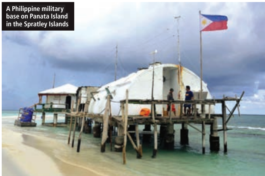
A Philippine military base on Panata Island in the Spratley Islands

The snag is that China has consistently rejected the ruling and there are no mechanisms by which it can be enforced. China is one of the five permanent members of the United Nations Security Council and would inevitably veto any move to, for example, impose sanctions on it for not accepting the award. China is likely to maintain not only its claims to sovereignty