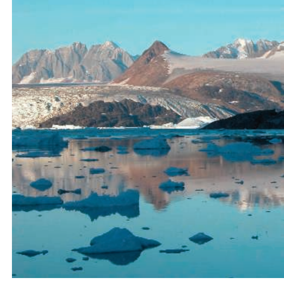
Icebergs. Large numbers of bergs are calved each year from the fast-flowing terminus of Kangerdlugssuaq Glacier, East Greenland, adding fresh water to the surrounding seas when they melt.

Taking the new evidence on the acceleration of ice-sheet outlet glaciers together with estimates of increasingly negative surface mass balance (7) yields, according to Rignot and Kanagaratnam (2), a contribution from the Greenland Ice Sheet of more than 0.5 mm year<sup>-1</sup> to global sea-level rise, over two-thirds