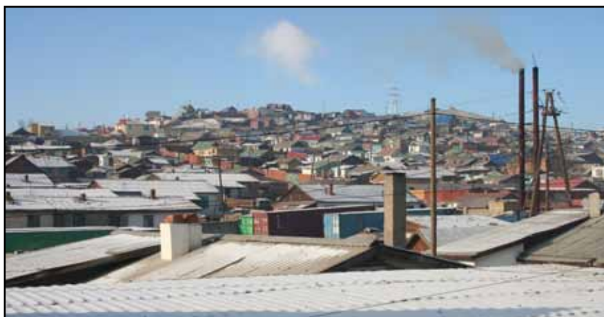
Figure 5: The expansion of the ger district onto the hills on the outskirts of Ulaanbaatar